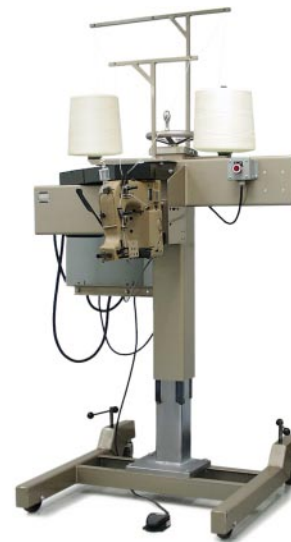
US100 with 80800C